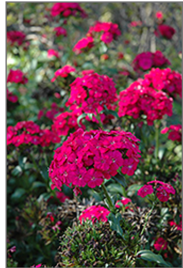
Amazon Neon Cherry Pinks flowers

This is a relatively low maintenance plant, and is best cleaned up in early spring before it resumes active growth for the season. It is a good choice for attracting bees and butterflies to your yard, but is not particularly attractive to deer who tend to leave it alone in favor of tastier treats. It has no significant negative characteristics.