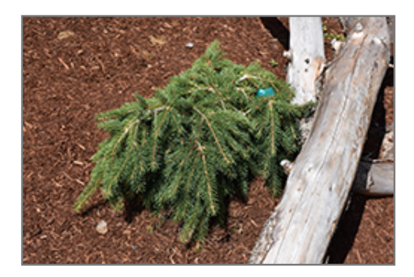
Formanek Norway Spruce

520 Highway 1 West Iowa City, Iowa 52246 (319) 337–8351 www.iowacitylandscaping.com