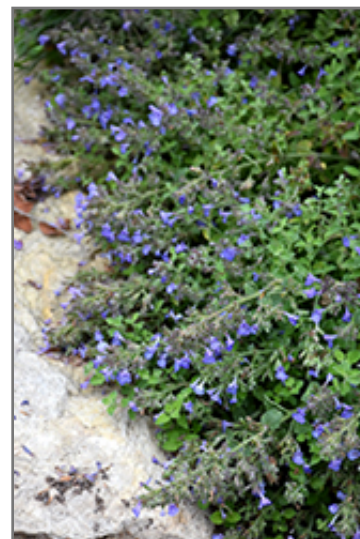
Kit Kat Catmint in bloom

Kit Kat Catmint is recommended for the following landscape applications;