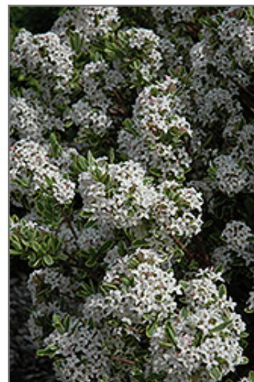
Carol Mackie Daphne flowers