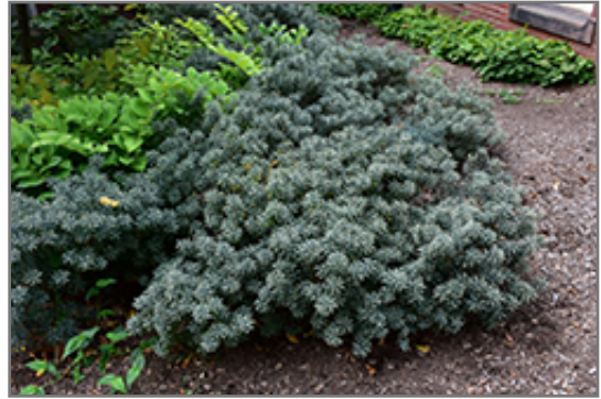
Carol Mackie Daphne

This shrub does best in full sun to partial shade. It prefers dry to average moisture levels with very well-drained soil, and will often die in standing water. It is not particular as to soil pH, but grows best in clay soils. It is somewhat tolerant of urban pollution, and will benefit from being planted in a relatively sheltered location. Consider applying a thick mulch around the root zone in winter to protect it in exposed locations or colder microclimates. This particular variety is an interspecific hybrid, and parts of it are known to be toxic to humans and animals, so care should be exercised in planting it around children and pets.