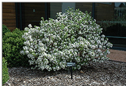
Carol Mackie Daphne in bloom