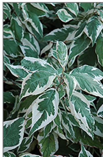
Ivory Halo Dogwood foliage