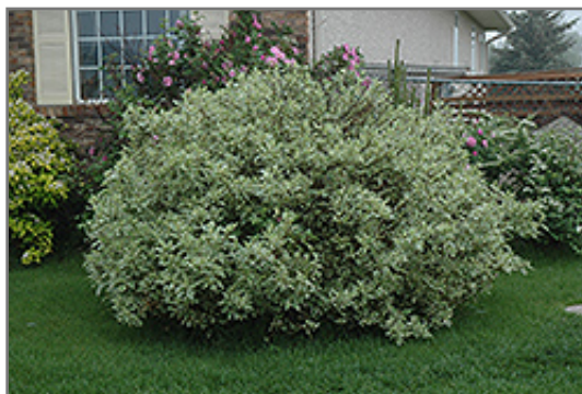
Ivory Halo Dogwood