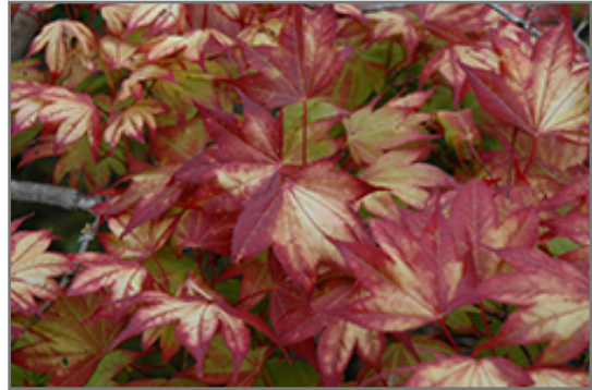
Tsuma Gaki Japanese Maple foliage

Tsuma Gaki Japanese Maple will grow to be about 10 feet tall at maturity, with a spread of 10 feet. It tends to be a little leggy, with a typical clearance of 2 feet from the ground, and is suitable for planting under power lines. It grows at a slow rate, and under ideal conditions can be expected to live for 60 years or more.