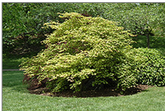
Tsuma Gaki Japanese Maple