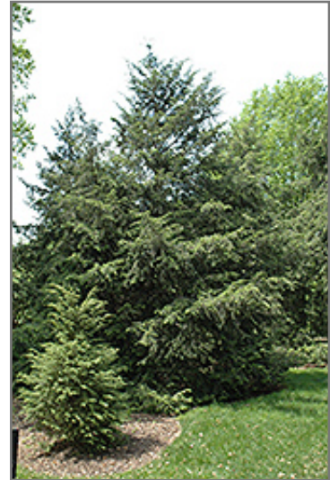
Canadian Hemlock