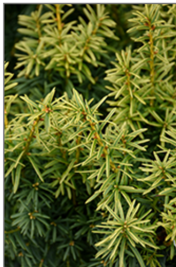
Dwarf Bright Gold Yew foliage