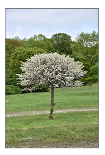
Lollipop Flowering Crab in bloom

This dwarf tree should only be grown in full sunlight. It prefers to grow in average to moist conditions, and shouldn't be allowed to dry out. It is not particular as to soil type or pH. It is highly tolerant of urban pollution and will even thrive in inner city environments. This particular variety is an interspecific hybrid.