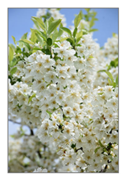
Lollipop Flowering Crab flowers