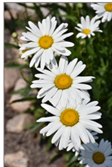
Silver Princess Shasta Daisy flowers