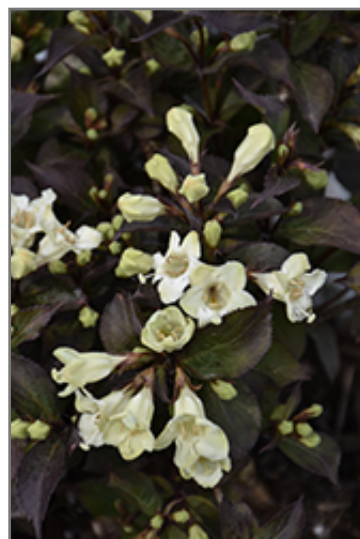
Wine & Spirits Weigela flowers