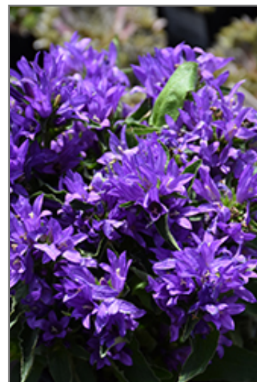
Genti Blue Clustered Bellflower flowers