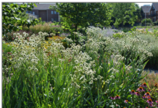
Rattlesnake Master in bloom

Rattlesnake Master is a fine choice for the garden, but it is also a good selection for planting in outdoor pots and containers. Because of its height, it is often used as a 'thriller' in the 'spiller-thriller-filler' container combination; plant it near the center of the pot, surrounded by smaller plants and those that spill over the edges. It is even sizeable enough that it can be grown alone in a suitable container. Note that when growing plants in outdoor containers and baskets, they may require more frequent waterings than they would in the yard or garden.