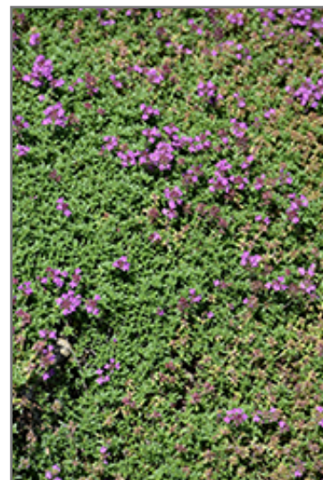
Creeping Thyme in bloom

Creeping Thyme is recommended for the following landscape applications;