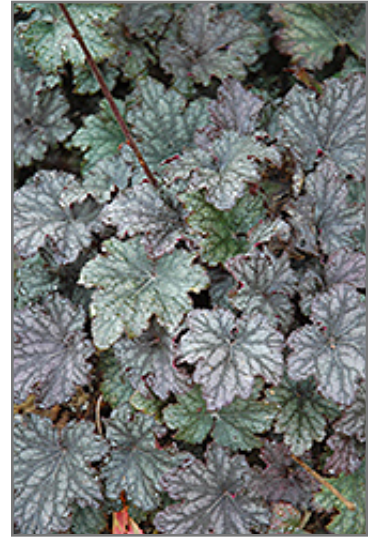
Frosted Violet Coral Bells foliage

This is a relatively low maintenance plant, and should be cut back in late fall in preparation for winter. It is a good choice for attracting hummingbirds to your yard. It has no significant negative characteristics.