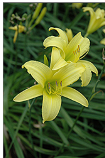
Hyperion Daylily flowers