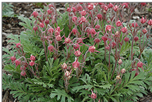
Prairie Smoke in bloom

This plant will require occasional maintenance and upkeep, and should be cut back in late fall in preparation for winter. It is a good choice for attracting butterflies to your yard, but is not particularly attractive to deer who tend to leave it alone in favor of tastier treats. Gardeners should be aware of the following characteristic(s) that may warrant special consideration;