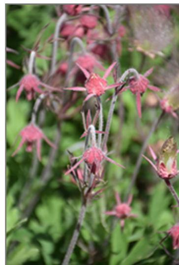
Prairie Smoke flower buds