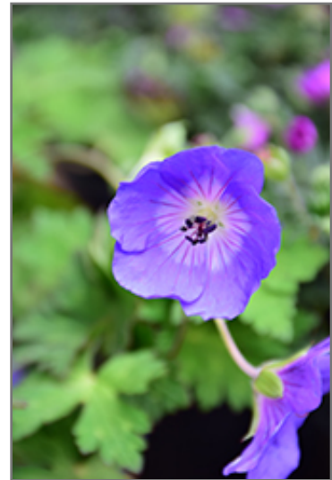
Rozanne Cranesbill flowers

This is a relatively low maintenance plant, and should only be pruned after flowering to avoid removing any of the current season's flowers. It is a good choice for attracting butterflies to your yard, but is not particularly attractive to deer who tend to leave it alone in favor of tastier treats. It has no significant negative characteristics.