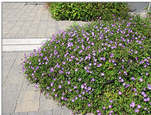
Rozanne Cranesbill in bloom

Rozanne Cranesbill is a fine choice for the garden, but it is also a good selection for planting in outdoor containers and hanging baskets. It is often used as a 'filler' in the 'spiller-thriller-filler' container combination, providing a mass of flowers against which the thriller plants stand out. Note that when growing plants in outdoor containers and baskets, they may require more frequent waterings than they would in the yard or garden.