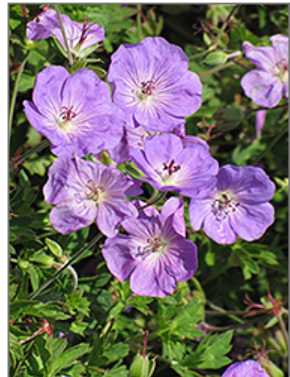
Rozanne Cranesbill flowers