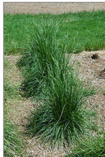
Schottland Hair Grass