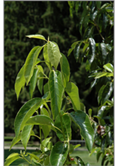
Red Rage Black Gum foliage

This tree does best in full sun to partial shade. It does best in average to evenly moist conditions, but will not tolerate standing water. It is very fussy about its soil conditions and must have rich, acidic soils to ensure success, and is subject to chlorosis (yellowing) of the foliage in alkaline soils. It is quite intolerant of urban pollution, therefore inner city or urban streetside plantings are best avoided, and will benefit from being planted in a relatively sheltered location. Consider applying a thick mulch around the root zone in winter to protect it in exposed locations or colder microclimates. This is a selection of a native North American species.