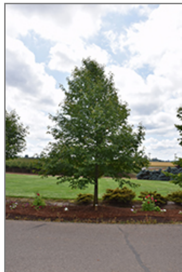
Red Rage Black Gum