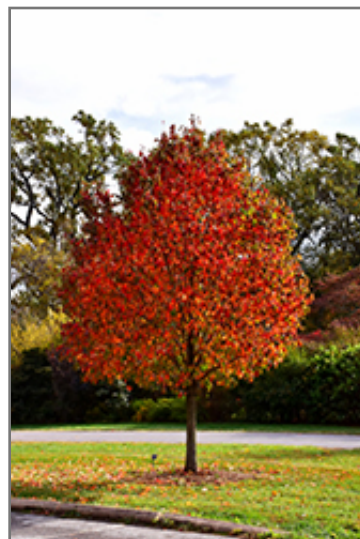
Red Rage Black Gum in fall