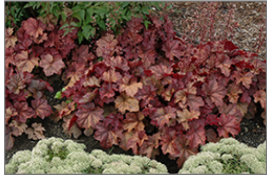
Lava Lamp Coral Bells

Lava Lamp Coral Bells is a fine choice for the garden, but it is also a good selection for planting in outdoor pots and containers. With its upright habit of growth, it is best suited for use as a 'thriller' in the 'spiller-thriller-filler' container combination; plant it near the center of the pot, surrounded by smaller plants and those that spill over the edges. Note that when growing plants in outdoor containers and baskets, they may require more frequent waterings than they would in the yard or garden.