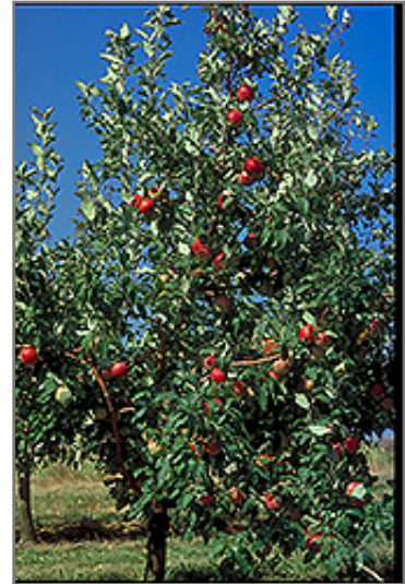
Zestar Apple fruit

This tree is typically grown in a designated area of the yard because of its mature size and spread. It should only be grown in full sunlight. It prefers to grow in average to moist conditions, and shouldn't be allowed to dry out. It is not particular as to soil type or pH. It is highly tolerant of urban pollution and will even thrive in inner city environments. This particular variety is an interspecific hybrid.