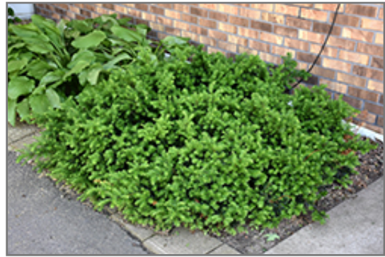
Emerald Spreader Yew

This shrub performs well in both full sun and full shade. However, you may want to keep it away from hot, dry locations that receive direct afternoon sun or which get reflected sunlight, such as against the south side of a white wall. It does best in average to evenly moist conditions, but will not tolerate standing water. It is not particular as to soil type or pH. It is highly tolerant of urban pollution and will even thrive in inner city environments, and will benefit from being planted in a relatively sheltered location. Consider applying a thick mulch around the root zone in winter to protect it in exposed locations or colder microclimates. This is a selected variety of a species not originally from North America, and parts of it are known to be toxic to humans and animals, so care should be exercised in planting it around children and pets.