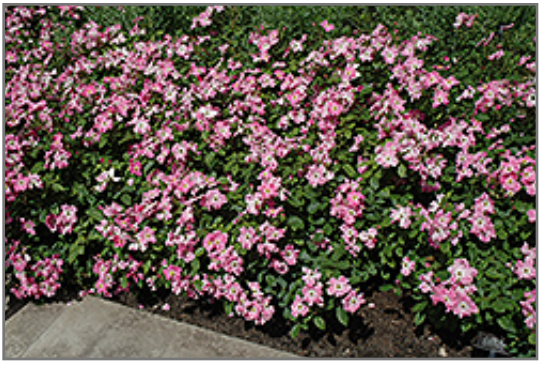
Nearly Wild Rose in bloom