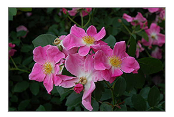
Nearly Wild Rose flowers

520 Highway 1 West Iowa City, Iowa 52246 (319) 337-8351 www.iowacitylandscaping.com