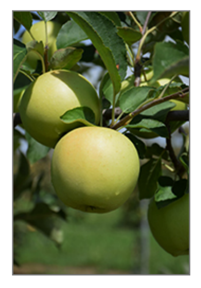
Golden Delicious Apple fruit

Golden Delicious Apple features showy clusters of lightly-scented white flowers with shell pink overtones along the branches in mid spring, which emerge from distinctive pink flower buds. It has forest green deciduous foliage. The pointy leaves turn yellow in fall. The fruits are showy chartreuse apples with yellow overtones, which are carried in abundance in mid fall. The fruit can be messy if allowed to drop on the lawn or walkways, and may require occasional clean-up.