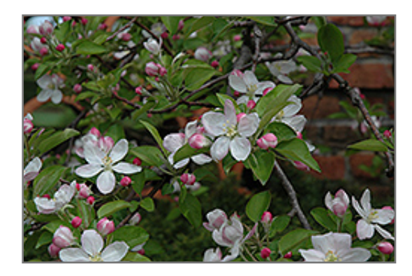
Golden Delicious Apple flowers

520 Highway 1 West Iowa City, Iowa 52246 (319) 337–8351 www.iowacitylandscaping.com