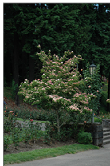
Heart Throb Chinese Dogwood in bloom