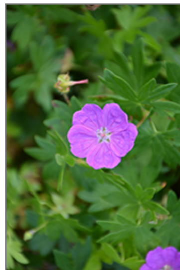
New Hampshire Purple Cranesbill flowers

New Hampshire Purple Cranesbill is a fine choice for the garden, but it is also a good selection for planting in outdoor pots and containers. It is often used as a 'filler' in the 'spiller-thriller-filler' container combination, providing a mass of flowers against which the thriller plants stand out. Note that when growing plants in outdoor containers and baskets, they may require more frequent waterings than they would in the yard or garden.