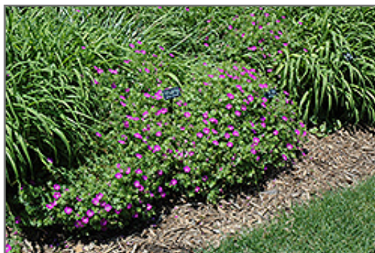
New Hampshire Purple Cranesbill in bloom