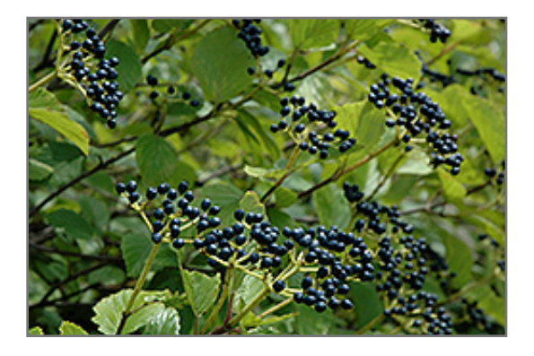
Raspberry Tart Viburnum fruit

This is a relatively low maintenance shrub, and should only be pruned after flowering to avoid removing any of the current season's flowers. It is a good choice for attracting birds to your yard, but is not particularly attractive to deer who tend to leave it alone in favor of tastier treats. It has no significant negative characteristics.