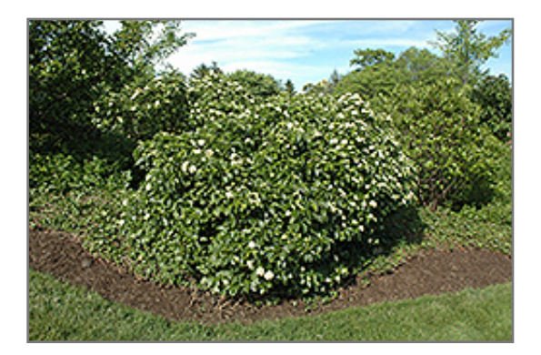
Raspberry Tart Viburnum in bloom

Raspberry Tart Viburnum will grow to be about 5 feet tall at maturity, with a spread of 5 feet. It has a low canopy, and is suitable for planting under power lines. It grows at a medium rate, and under ideal conditions can be expected to live for 40 years or more.