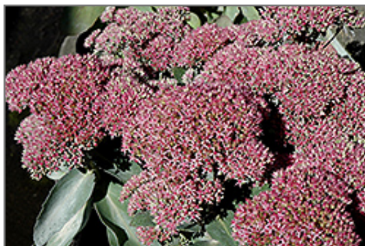
Autumn Delight Stonecrop flowers

Autumn Delight Stonecrop is a dense herbaceous perennial with an upright spreading habit of growth. Its relatively coarse texture can be used to stand it apart from other garden plants with finer foliage.