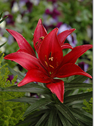
Lily Looks Tiny Ghost Lily flowers