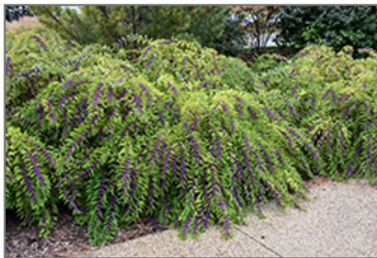
Issai Beautyberry fruit