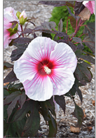
Kopper King Hibiscus flowers