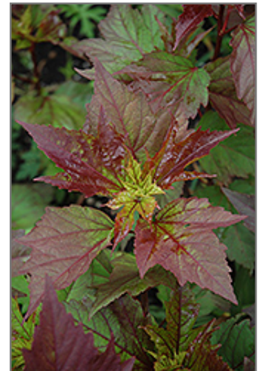
Kopper King Hibiscus foliage