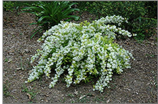
Chardonnay Pearls Deutzia in bloom

Chardonnay Pearls Deutzia is recommended for the following landscape applications;