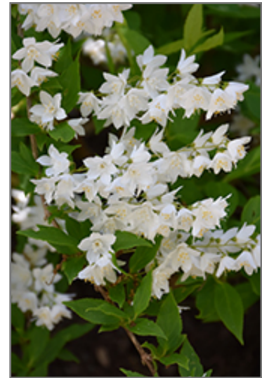
Chardonnay Pearls Deutzia flowers