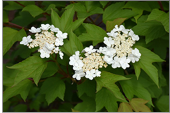
Redwing Highbush Cranberry flowers

Redwing Highbush Cranberry is a dense multi-stemmed deciduous shrub with an upright spreading habit of growth. Its average texture blends into the landscape, but can be balanced by one or two finer or coarser trees or shrubs for an effective composition.