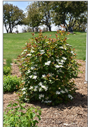
Redwing Highbush Cranberry in bloom