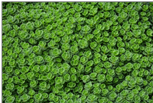
John Creech Stonecrop foliage

John Creech Stonecrop will grow to be only 3 inches tall at maturity, with a spread of 12 inches. When grown in masses or used as a bedding plant, individual plants should be spaced approximately 10 inches apart. Its foliage tends to remain low and dense right to the ground. It grows at a fast rate, and under ideal conditions can be expected to live for approximately 10 years. As an herbaceous perennial, this plant will usually die back to the crown each winter, and will regrow from the base each spring. Be careful not to disturb the crown in late winter when it may not be readily seen!