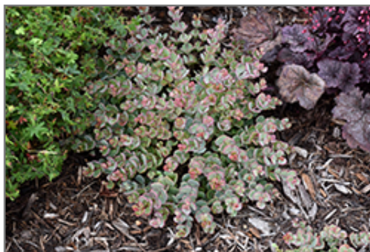
October Daphne