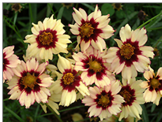
Autumn Blush Tickseed flowers