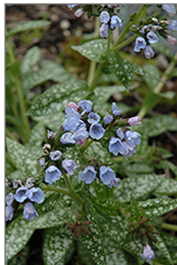
Roy Davidson Lungwort flowers