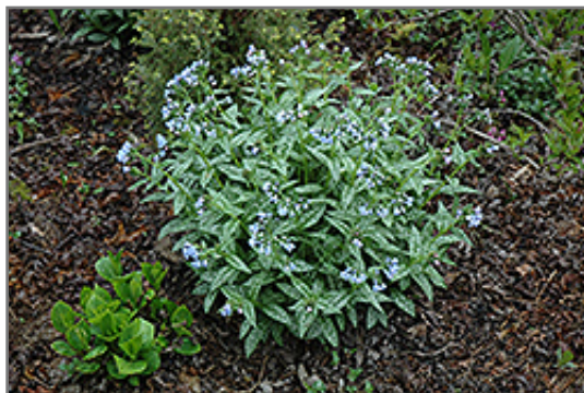
Roy Davidson Lungwort in bloom