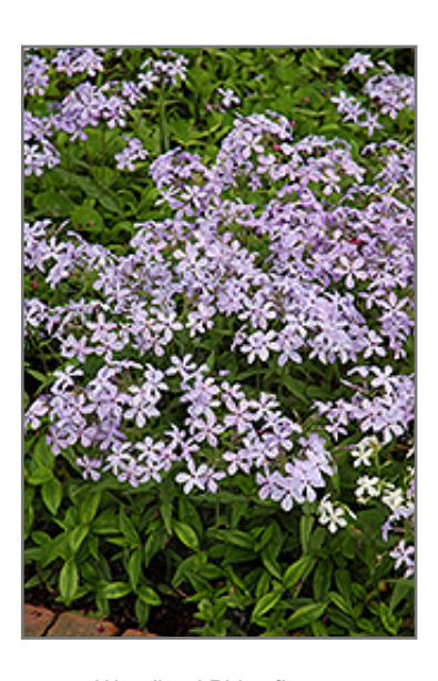
Woodland Phlox flowers

Woodland Phlox will grow to be about 8 inches tall at maturity, with a spread of 18 inches. When grown in masses or used as a bedding plant, individual plants should be spaced approximately 16 inches apart. Its foliage tends to remain low and dense right to the ground. It grows at a medium rate, and under ideal conditions can be expected to live for approximately 10 years. As an herbaceous perennial, this plant will usually die back to the crown each winter, and will regrow from the base each spring. Be careful not to disturb the crown in late winter when it may not be readily seen!