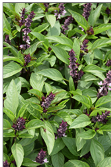
Sweet Basil flowers

Sweet Basil is a good choice for the edible garden, but it is also well-suited for use in outdoor pots and containers. It is often used as a 'filler' in the 'spiller-thriller-filler' container combination, providing the canvas against which the larger thriller plants stand out. Note that when growing plants in outdoor containers and baskets, they may require more frequent waterings than they would in the yard or garden.