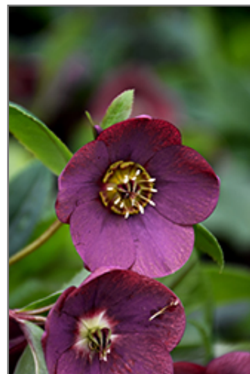
Honeymoon Rome In Red Hellebore flowers

Honeymoon Rome In Red Hellebore is recommended for the following landscape applications;