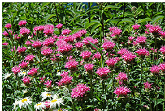
Marshall's Delight Beebalm flowers