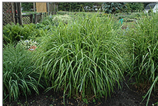
Porcupine Grass