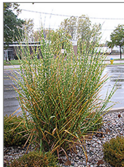
Porcupine Grass