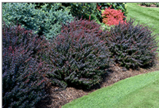
Sunjoy Mini Maroon Japanese Barberry

Sunjoy Mini Maroon Japanese Barberry is recommended for the following landscape applications;