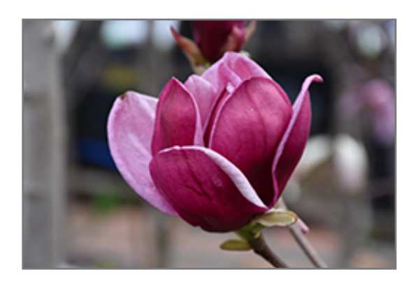
Genie Magnolia flowers