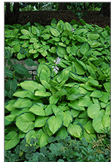
Gold Standard Hosta in bloom