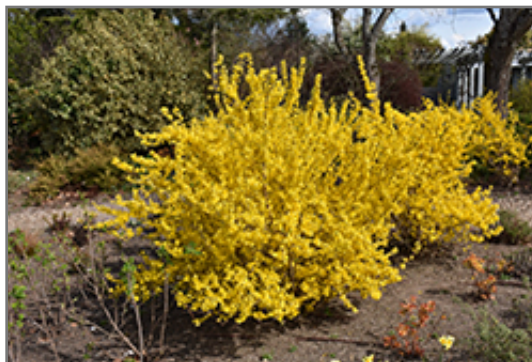
Magical Gold Forsythia in bloom