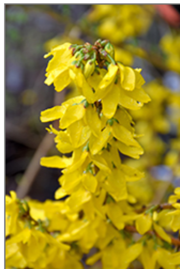
Magical Gold Forsythia flowers

Magical Gold Forsythia makes a fine choice for the outdoor landscape, but it is also well-suited for use in outdoor pots and containers. Because of its height, it is often used as a 'thriller' in the 'spiller-thriller-filler' container combination; plant it near the center of the pot, surrounded by smaller plants and those that spill over the edges. It is even sizeable enough that it can be grown alone in a suitable container. Note that when grown in a container, it may not perform exactly as indicated on the tag - this is to be expected. Also note that when growing plants in outdoor containers and baskets, they may require more frequent waterings than they would in the yard or garden.