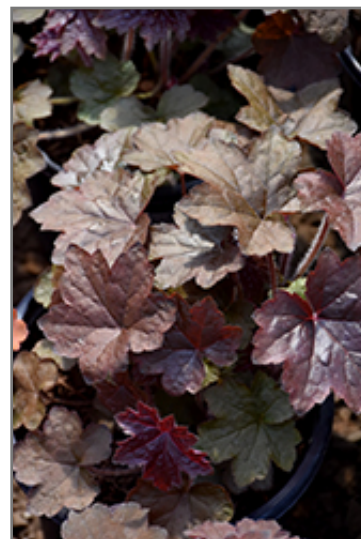
Palace Purple Coral Bells foliage

Palace Purple Coral Bells is recommended for the following landscape applications;