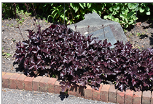
Obsidian Coral Bells