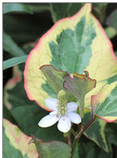
Chameleon Houttuynia flowers